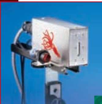
Run one or two printheads; select from three different printhead sizes; all components are field-installable