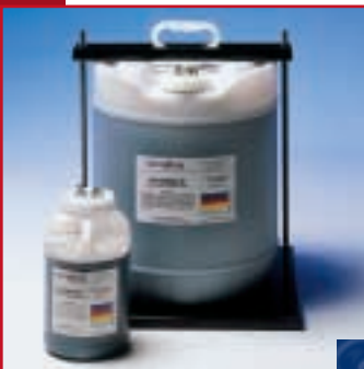
Squid Ink's patented SQ-60™ no-clog ink allows users to leave ink in their printhead without having to flush their system