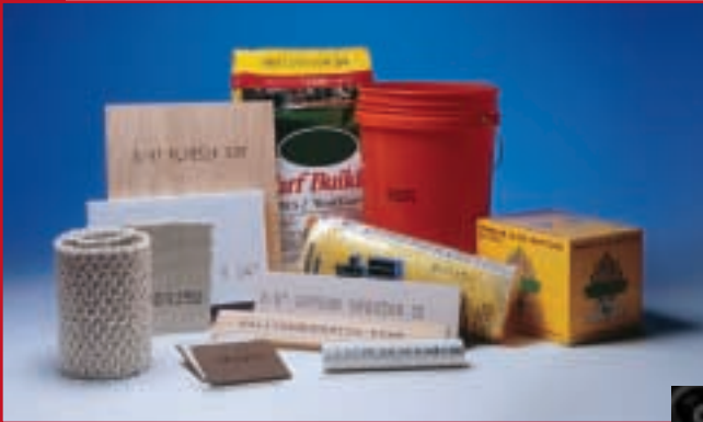
The SQ/2 utilizes water-based or solvent-based inks for printing on a wide range of porous and non-porous surfaces