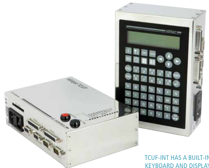
TCUF-INT HAS A BUILT-IN KEYBOARD AND DISPLAY

The TCUF controllers are designed for limited printing jobs still requiring a high-resolution and high quality print