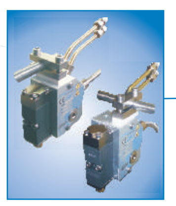
Two mounting bracket positions for easy configuration