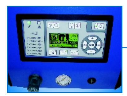
7 day / 3 shift programmable clock. Reduces setup and increases efficiency.

The new LCD control panel offers easy and intuitive programming. The unit can be configured to cover each user's specific needs.