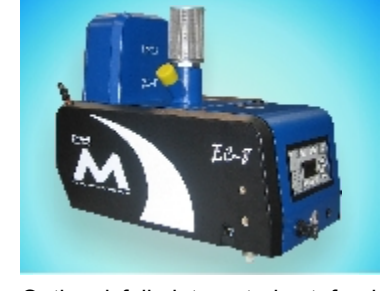
Optional, fully-integrated autofeed system increases safety and prevents overfilling.