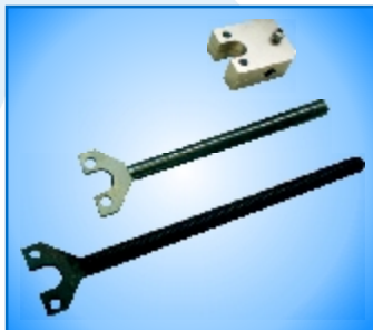
Total adaptability to various existing brackets in the market