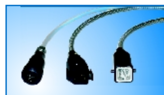
100% compatible connectors