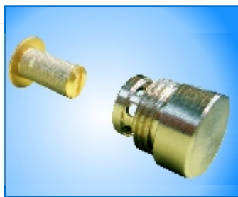
Internal filter provides continuous adhesive filtration