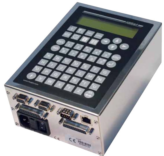
THE CUF HAS INTEGRATED KEYBOARD & DISPLAY

The Controller Unit is equipped with ethernet and serial communication allowing full remote controlled variable printing. In combination with HSAJET® printheads it has the function of a stand-alone system.