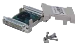
Jumper Box for data selection on HPHF printers

CHECK OUR WEBSITE FOR LATEST REVISION OF THIS DATASHEET