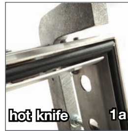
hot knife 1a